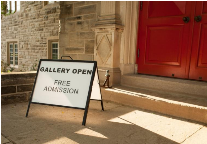
New open sign in front of McIntosh Gallery.