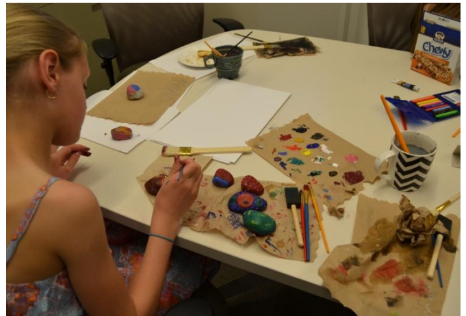
Young visitors to the gallery try their hand at creating art during the Children's Collage Summer Workshop Series, Summer 2013.